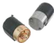
D Series High Flow Solenoid Valves

Visit GemsSensors.com to view our full range of solenoid valves or to inquire on custom solutions