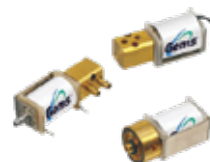
M Series Miniature Solenoid Valves